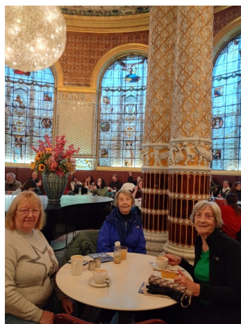
V & A