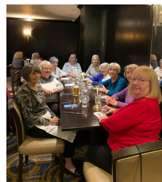
Mixing with Royalty