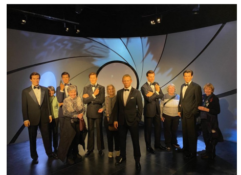
Madame Tussauds with James Bond!